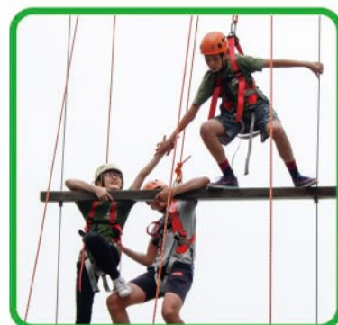
S2 Leadership Training Camp