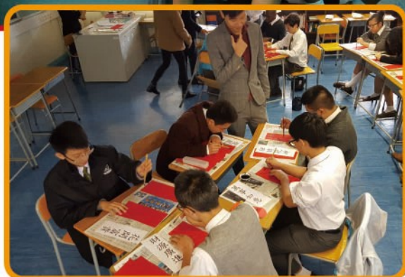
Chinese Calligraphy Class