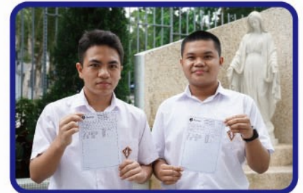
Students got the highest grade A* in Chinese Subject (GCSE)