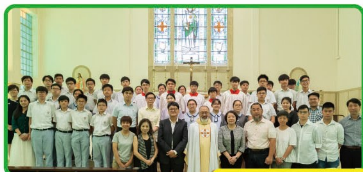
St. Joan of Arc Feast Day Thanksgiving Mass