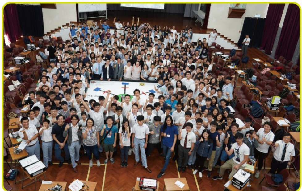
Fun Fun STEM Week