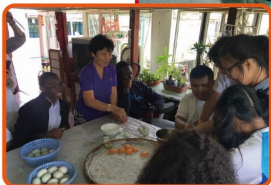
Tai O Fishing Village Tour