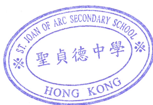
YUEN Cheung Oi Principal

You are like salt for the whole human race, You are like light for the whole world. (Matthew 5:13-14)